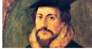
John Calvin - 1509-1564

A theological system known as Calvinism has influenced Christendom more than other system or man-made teachings. Sadly, this theological monstrosity has also influenced many in churches of Christ. For the next several weeks we will spend some time discussing the major principles associated with Calvinism. So, just what is Calvinism?